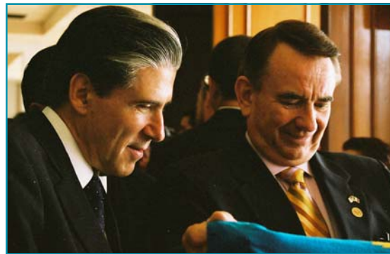
Mexico Secretariat of Health Dr. Julio Frenk Mora (left) and U.S. Secretary of Health Tommy Thompson at the 4th Annual Binational Meeting in Saltillo, Coahuila, Mexico.

The 4th Annual Binational meeting of the Commission was held in Saltillo, Coahuila, on December 11 and 12, 2003. The meeting was presided over by the Commissioners Tommy Thompson, U.S. Secretary of Health and Human Services, and Mexico's Secretary of Health Julio Frenk Mora. One of the highlights was the