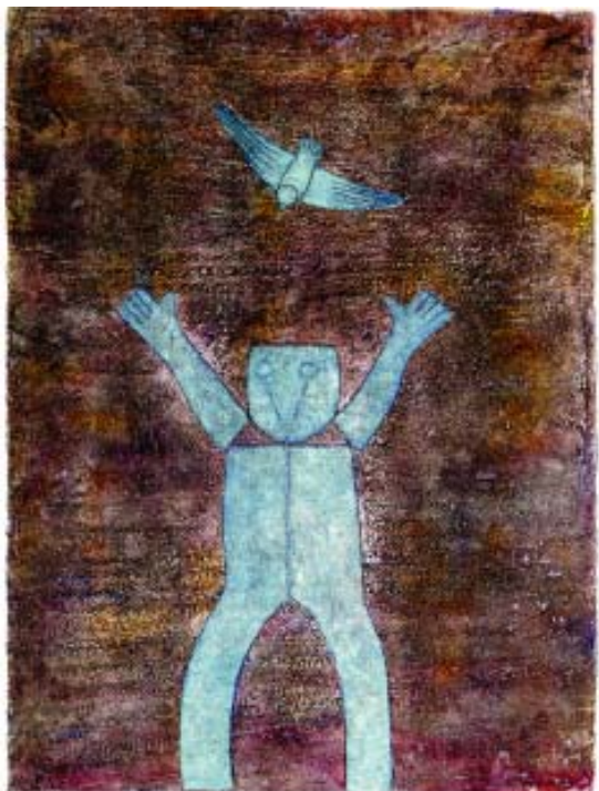
Semana Binacional de Salud Fronteriza 2006 Border Binational Health Week 2006