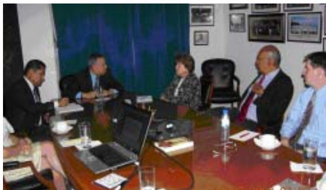
Collaborators setting the agenda for Telemedicine.