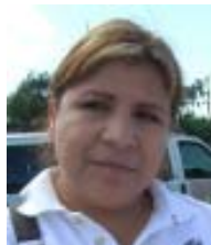
México Border Hero